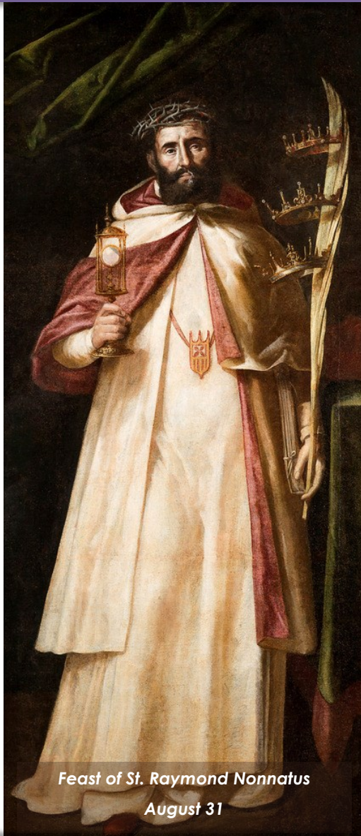
Feast of St. Raymond Nonnatus August 31