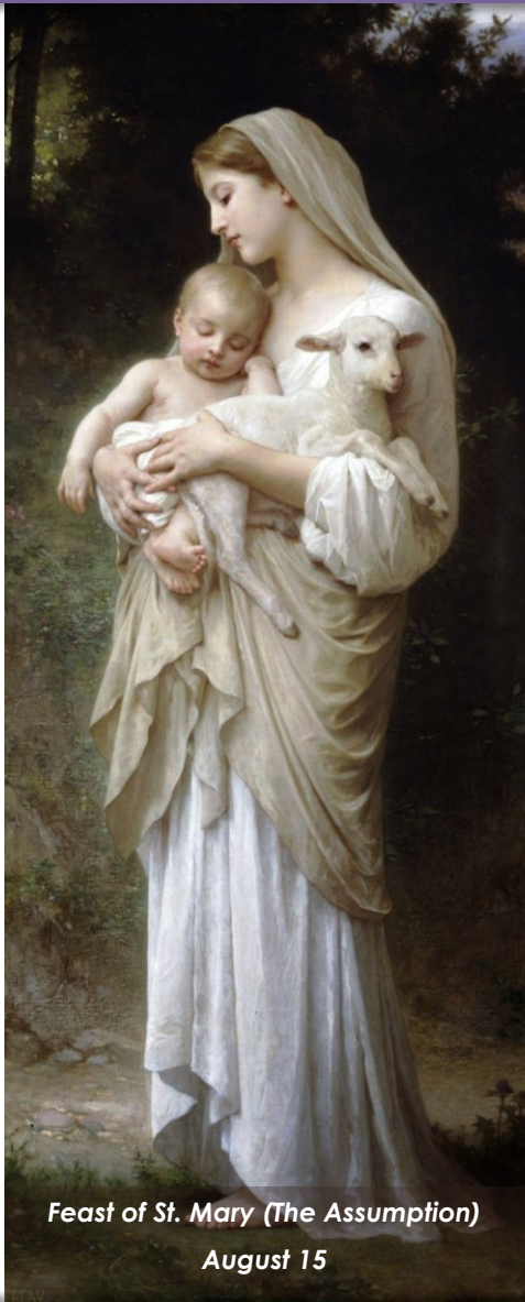
Feast of St. Mary (The Assumption) August 15