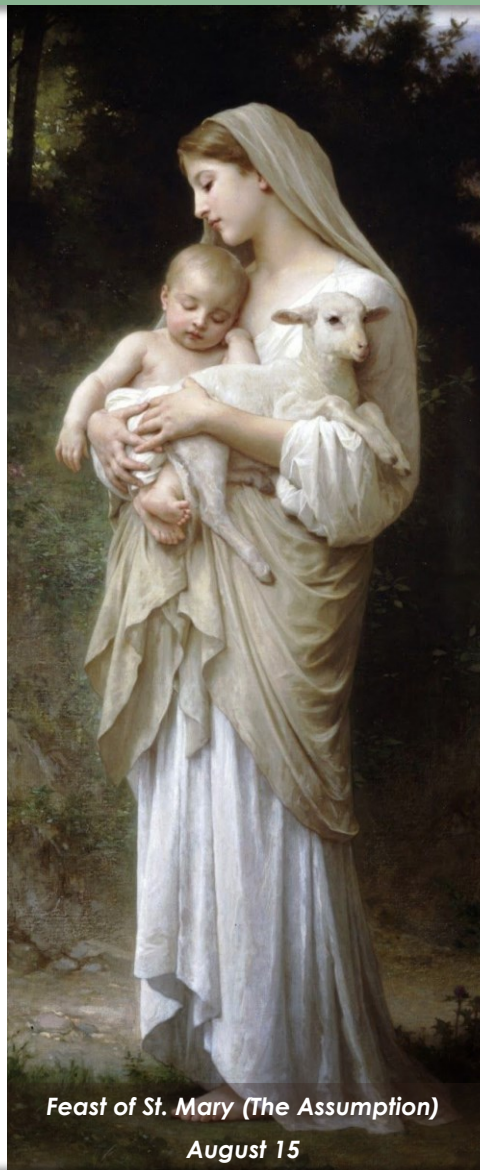
Feast of St. Mary (The Assumption) August 15