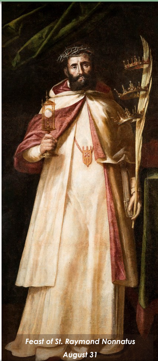
Feast of St. Raymond Nonnatus August 31