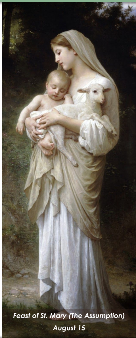
Feast of St. Mary (The Assumption) August 15