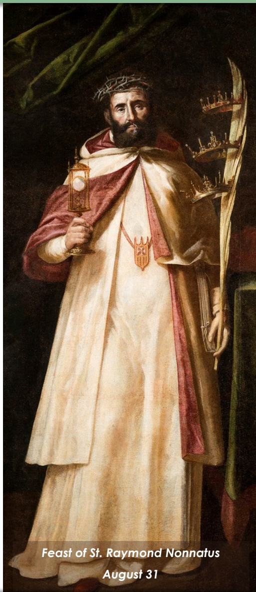
Feast of St. Raymond Nonnatus August 31