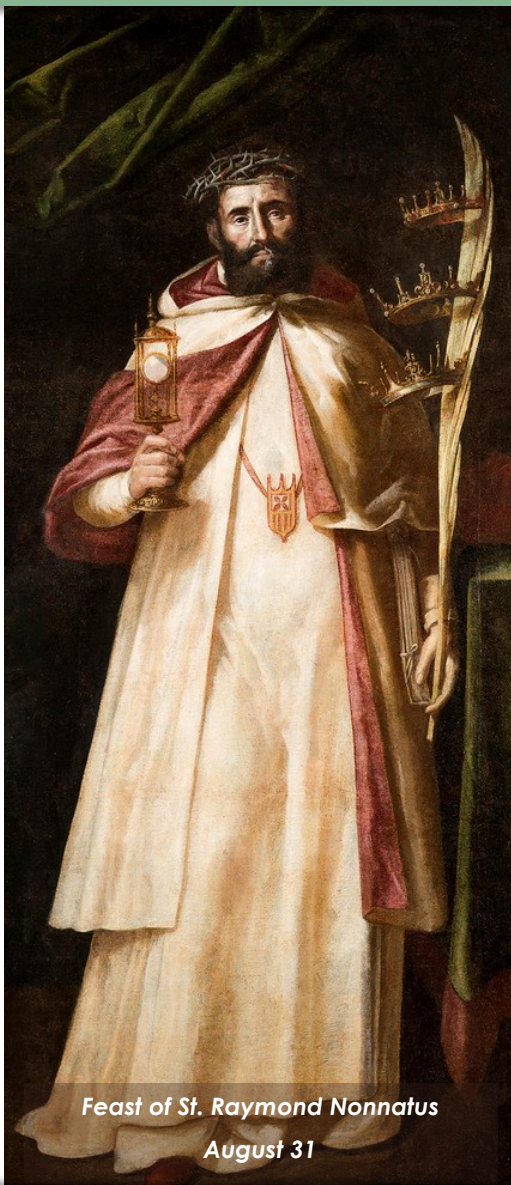
Feast of St. Raymond Nonnatus August 31