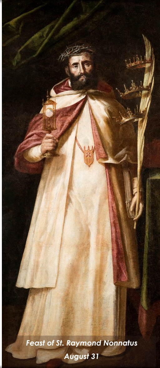
Feast of St. Raymond Nonnatus August 31