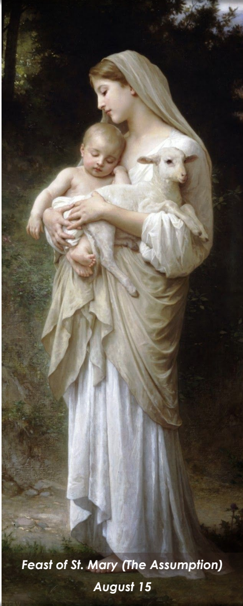
Feast of St. Mary (The Assumption) August 15