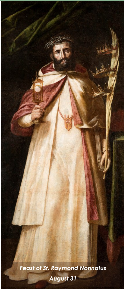
Feast of St. Raymond Nonnatus August 31