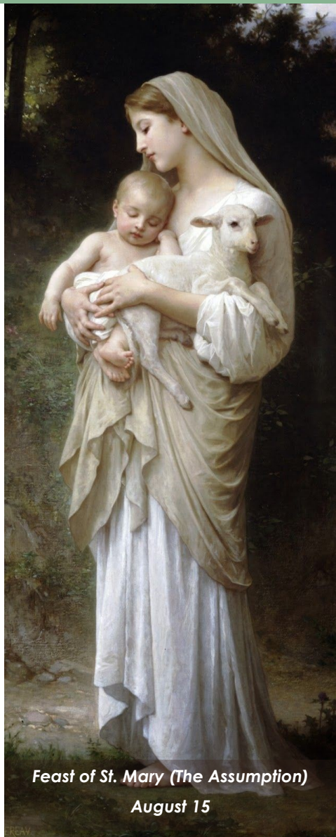
Feast of St. Mary (The Assumption) August 15