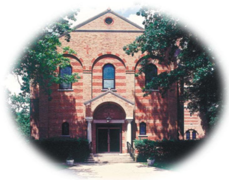
St. Raymond Raymond 306 S. McElroy Street Raymond, Illinois 62560 217-229-4435