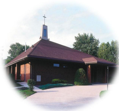
St. Mary Farmersville

310 Noble Street Farmersville, Illinois 62533 217-227-3349