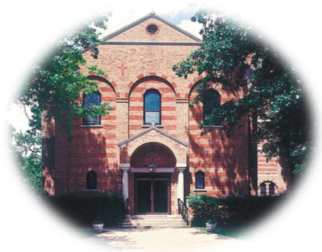
St. Raymond Raymond 306 S. McElroy Street Raymond, Illinois 62560 217-229-4435