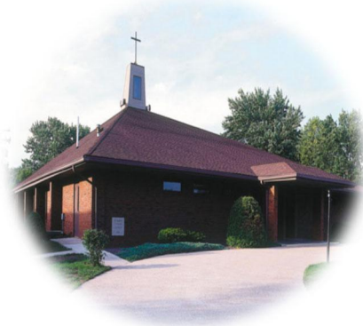
St. Mary Farmersville

310 Noble Street Farmersville, Illinois 62533 217-227-3349