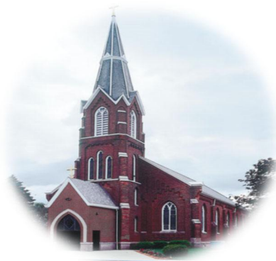
St. Maurice Morrisonville 706 E. Fourth Street (P.O. Box # 45) Morrisonville, Illinois 62546 217-526-3363

310 Noble Street Farmersville, Illinois 62533 217-227-3349