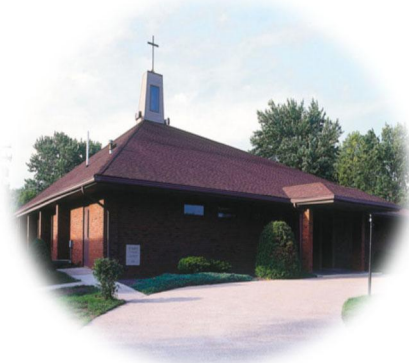
St. Mary Farmersville

310 Noble Street Farmersville, Illinois 62533 217-227-3349