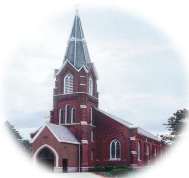
St. Maurice Morrisonville 706 E. Fourth Street (P.O. Box # 45) Morrisonville, Illinois 62546 217-526-3363

310 Noble Street Farmersville, Illinois 62533 217-227-3349