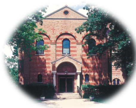
St. Raymond Raymond 306 S. McElroy Street Raymond, Illinois 62560 217-229-4435