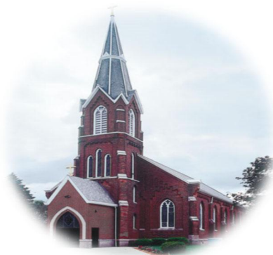
St. Maurice Morrisonville 706 E. Fourth Street (P.O. Box # 45) Morrisonville, Illinois 62546 217-526-3363

310 Noble Street Farmersville, Illinois 62533 217-227-3349