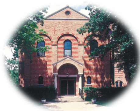
St. Raymond Raymond 306 S. McElroy Street Raymond, Illinois 62560 217-229-4435