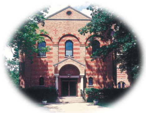
St. Raymond Raymond 306 S. McElroy Street Raymond, Illinois 62560 217-229-4435