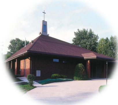
St. Mary Farmersville

310 Noble Street Farmersville, Illinois 62533 217-227-3349