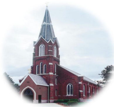
St. Maurice Morrisonville 706 E. Fourth Street (P.O. Box # 45) Morrisonville, Illinois 62546 217-526-3363

310 Noble Street Farmersville, Illinois 62533 217-227-3349