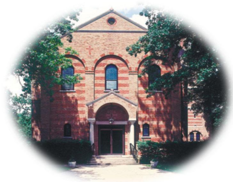
St. Raymond Raymond 306 S. McElroy Street Raymond, Illinois 62560 217-229-4435