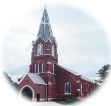
St. Maurice Morrisonville 706 E. Fourth Street (P.O. Box # 45) Morrisonville, Illinois 62546 217-526-3363

310 Noble Street Farmersville, Illinois 62533 217-227-3349