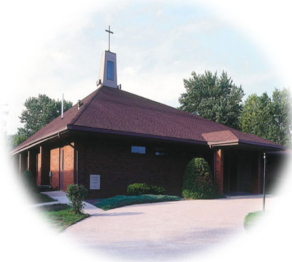
St. Mary Farmersville

310 Noble Street Farmersville, Illinois 62533 217-227-3349