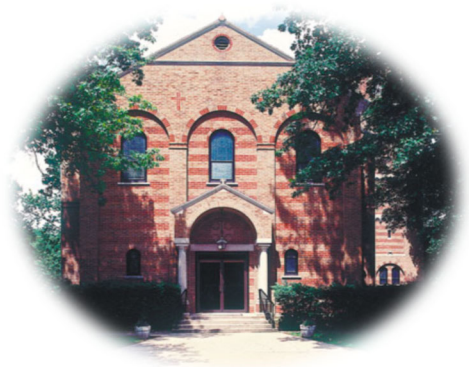
St. Raymond Raymond 306 S. McElroy Street Raymond, Illinois 62560 217-229-4435