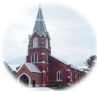
St. Maurice Morrisonville 706 E. Fourth Street (P.O. Box # 45) Morrisonville, Illinois 62546 217-526-3363

310 Noble Street Farmersville, Illinois 62533 217-227-3349