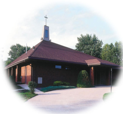
St. Mary Farmersville

310 Noble Street Farmersville, Illinois 62533 217-227-3349